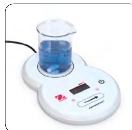
Stirrer Compact AS20