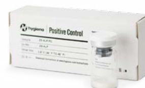
Positive Control Kit for ZymoSnap ALP Alkaline Phosphatase Test