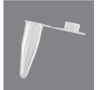
Individual tubes are available with attached caps or without a cap

Axygen PCR tubes are ideal for standard and real-time PCR applications. Our strip and individual tubes feature thin walls for precise thermal transfer and tight-fitting caps for a leakproof seal. Choose from a variety of configurations and cap styles.