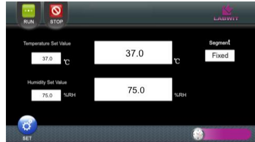
Touch Screen Controller